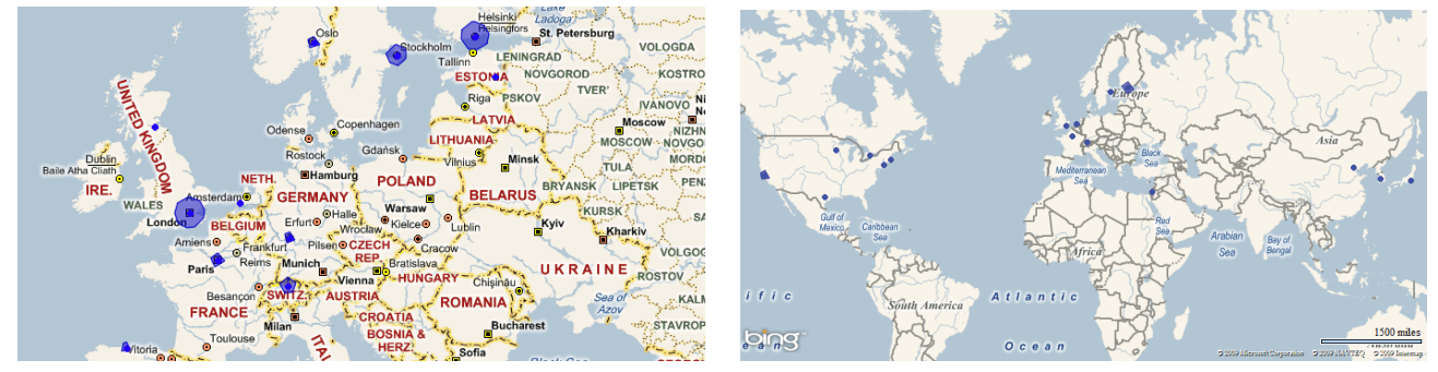
(a) Contributions to FIREFOX from locations in Europe. Blue circles (b) Contributions to content event handling in FIREFOX from locations indicate locations contributing to FIREFOX. The number of contributions is across the world. Blue circles indicate locations contributing to FIREFOX. proportional to the area of each circle.